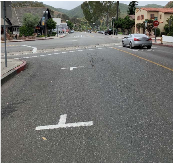
Third Street near Forest