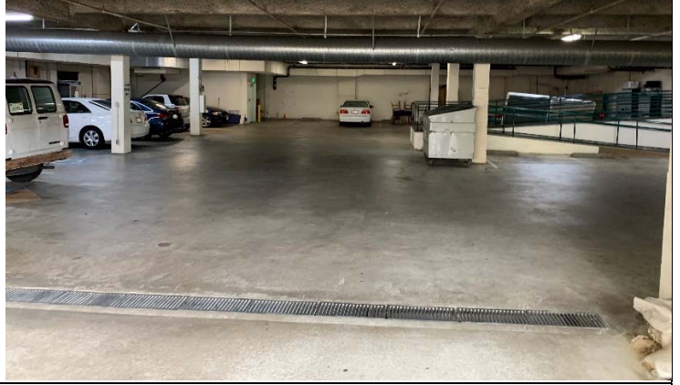
Private level of Hagan Place