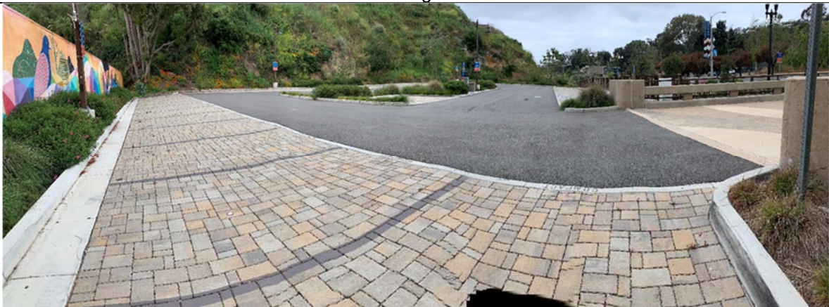
Christmas Tree Lot across from the Festival