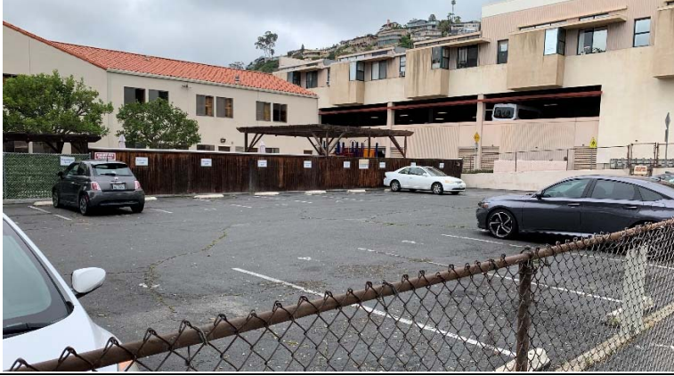
Presbyterian Church Lot at Mermaid and Second