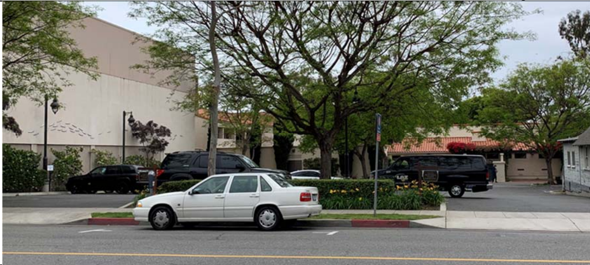
Presbyterian Church Lot on Third Street across from Susi Q