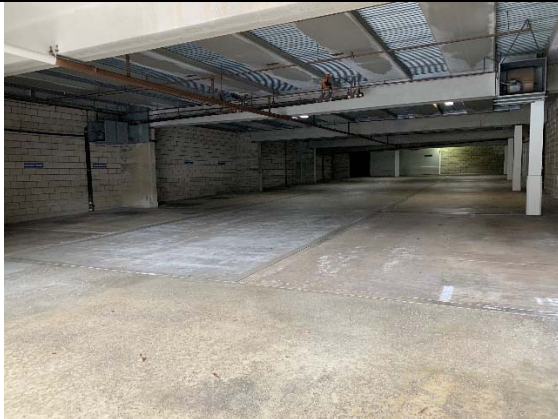
Commercial Building on Third Street