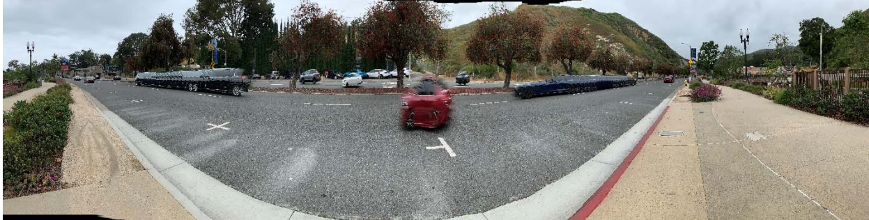
Broadway across from Festival looking both ways