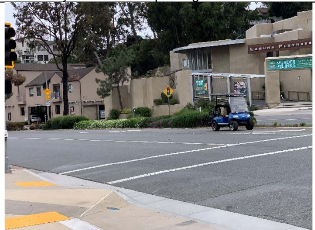
Broadway in front of Playhouse