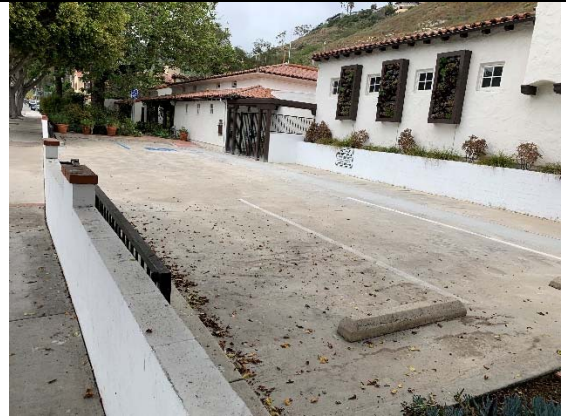
Water District on Third Street Near Forest