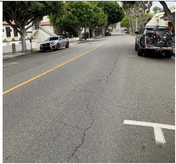
Third Street looking east