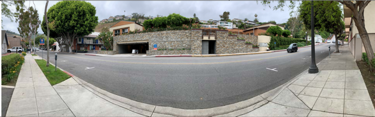
Third Street across from Susi Q – in front of proposed Presbyterian Church parking structure site