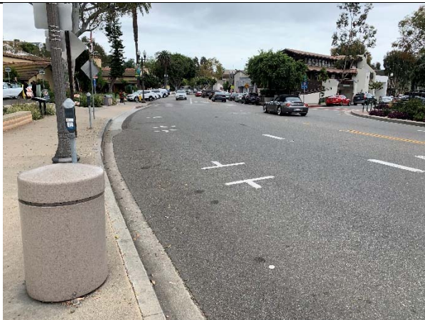
Forest near Broadway looking toward City Hall